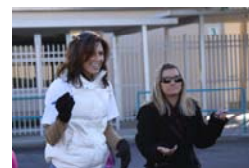
Parents LOVE to volunteer at HLE! Are you a volunteer?