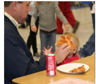
Dads, and moms, enjoying pizza at an All Pro Dad event!

Our first event of the year will be held on September 11th! We will meet in the HLE Café at 7:00 AM – before school starts! Cafeteria breakfast costs no more than $3.00. We hope to see you in September.