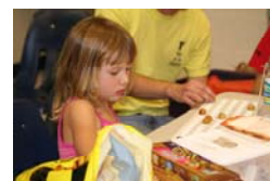
Don't miss this year's spring fling and silent auction! The kids had a terrific time and the parents won some great prizes!