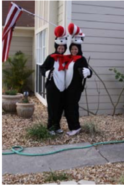
Dr. Seuss Week was a hoot! Teachers received Dr. Seuss books as a gift from the PTA.